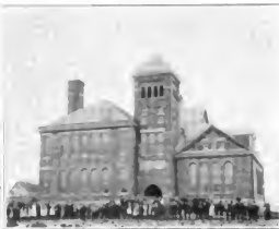
PUBLIC SCHOOL, BUFFALO CENTER Built in 1896; rebuilt 1912.